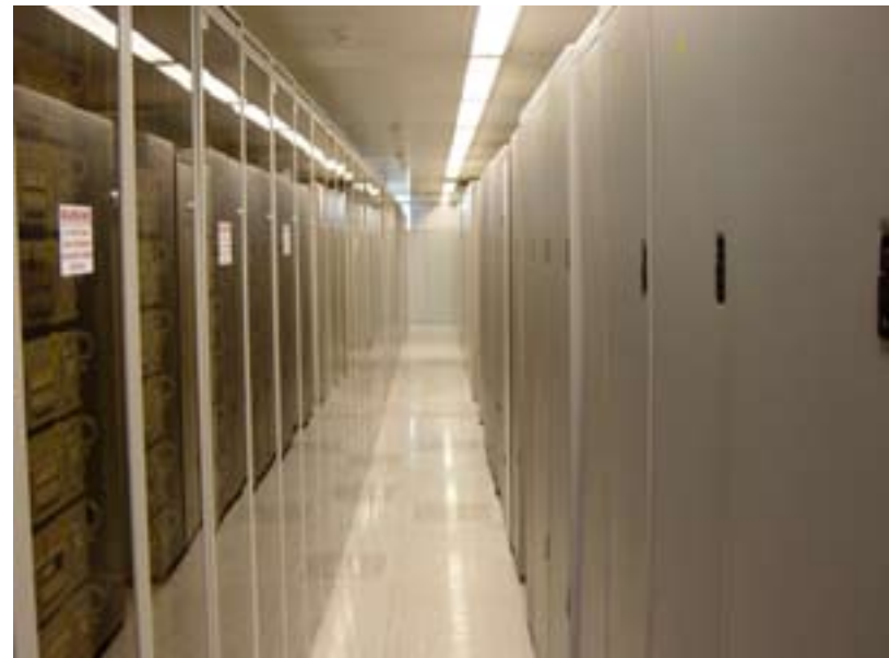
Forfront servers at Telecity House, London Docklands